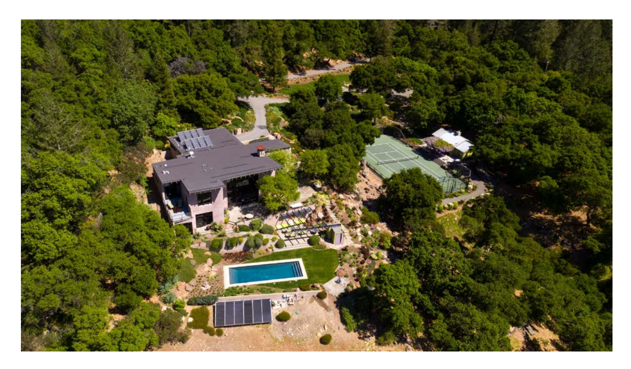
An Equal Opportunity Company. Equal Housing Opportunity. The information above has been provided by various sources and is deemed reliable but not guaranteed. This document contains privileged information intended only for the use of the intended recipient and is not to be disseminated.